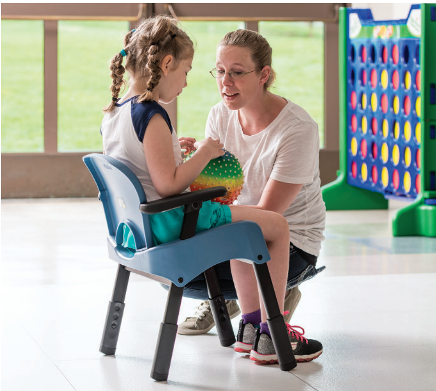
Adjusting the rear legs shorter than the front legs gives the chair a slight tilt, which can help some students relax.