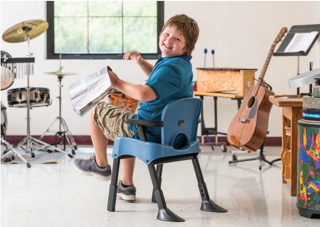
Stability feet attach to the back legs to accommodate your more active, tip-prone students.